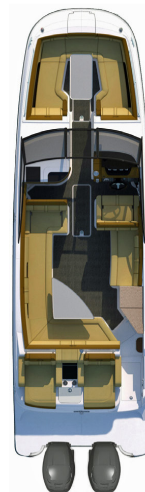
Standard Seating Plan

Painted Trailer w/ Rollers & Dual-Axle Disc Brakes Galvanized Trailer w/ Rollers & Dual-Axle Disc Brakes Painted Trailer w/ Bunks & Dual-Axle Disc Brakes Galvanized Trailer w/ Bunks & Dual-Axle Disc Brakes